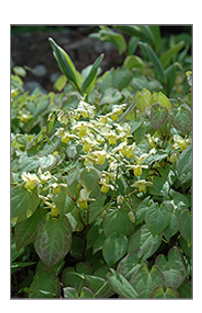
Yellow Barrenwort flowers

Delicate shooting star-like lemon yellow flowers; heart-shaped green leaves have reddish overtones in spring and fall; makes a great groundcover that is tolerant of dry shade once established; also grows well in moisture if well-drained