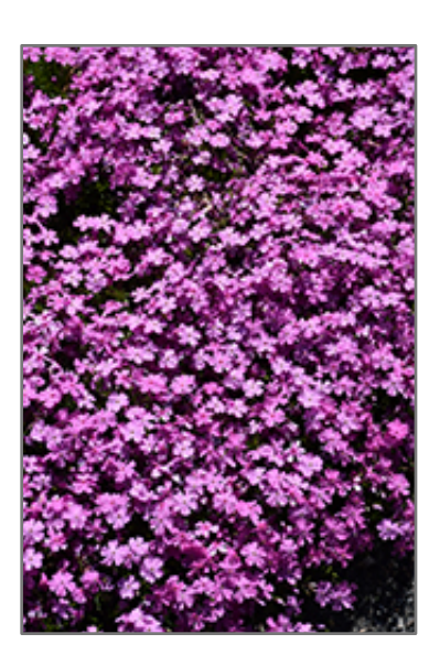
Emerald Pink Moss Phlox flowers

Emerald Pink Moss Phlox is smothered in stunning shell pink star-shaped flowers at the ends of the stems from early to late spring. Its tiny needle-like leaves remain emerald green in colour throughout the year.