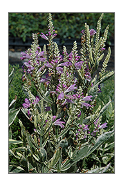
Variegated Obedient Plant flowers