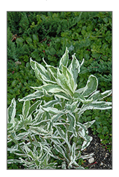
Variegated Obedient Plant foliage