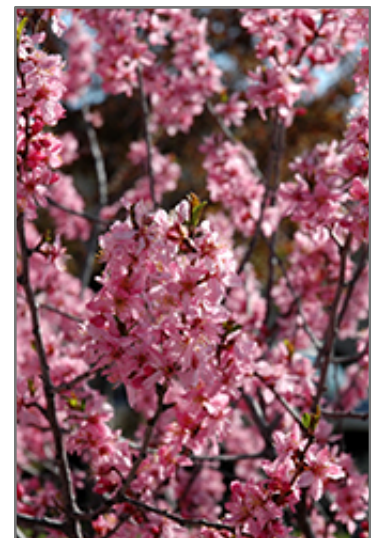
Muckle Plum (tree form) flowers