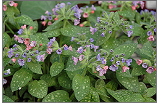
Mrs. Moon Lungwort flowers

Other Names: Lords And Ladies, Bethlehem Sage