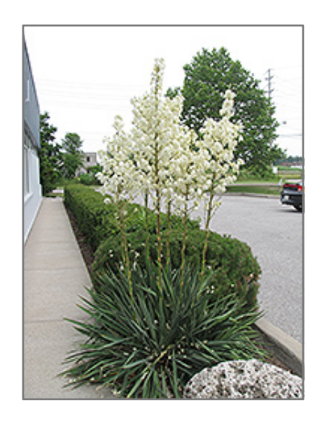
Adam's Needle in bloom