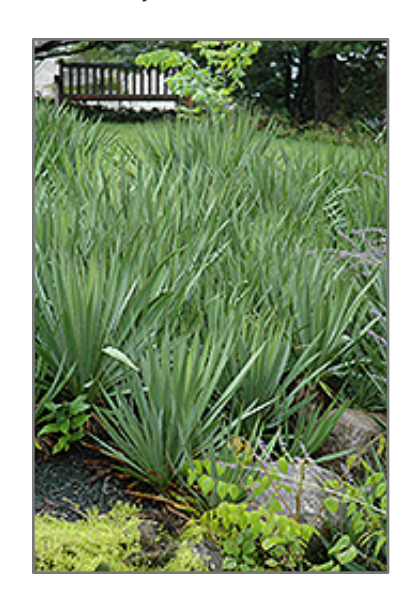
Adam's Needle