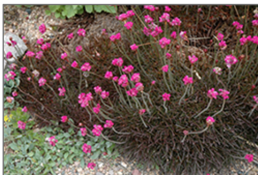
Red-leaved Sea Thrift in bloom