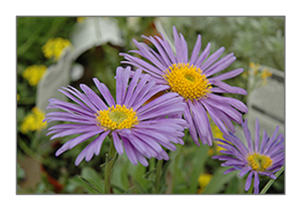
Goliath Alpine Aster flowers

A wonderful spring blooming addition to garden beds, borders or patio containers; low growing, mounded green foliage produces stems featuring lilac daisy flowers with yellow eyes; a drought tolerant variety requiring little to no maintenance