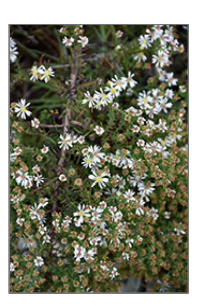
Snow Flurry Aster flowers

A drought tolerant, low growing, spreading variety that looks stunning in rock gardens, borders or as groundcover; features narrow green foliage and small, dainty white flowers that bloom during the fall; easy to grow, requiring little to no maintenance