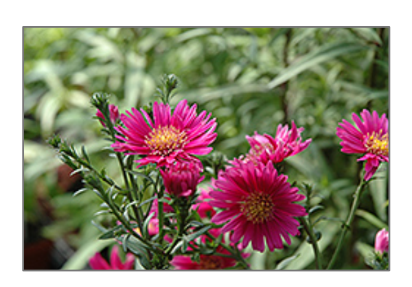
Jenny Aster flowers

A profusion of rose-pink flowers and attractive lance-like green leaves; prefers cool, moist soil; water regularly from the root zone instead of from the top to reduce fungal disease, and to encourage more blooms