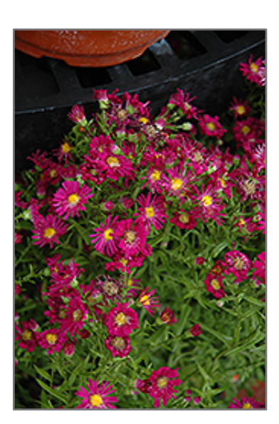
Winston Churchill Aster flowers

A profusion of bright, cherry red flowers and attractive lance-like green leaves; prefers cool, moist soil; water regularly from the root zone instead of from the top to reduce fungal disease, and to encourage more blooms