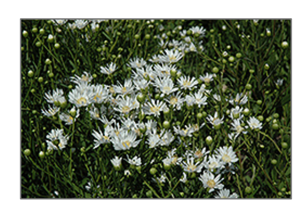
White Aster flowers

A mounded, bushy variety, perfect for adding color to fall gardens; snow white daisy-like flowers with pale yellow centers are featured on narrow, green foliage; easy to grow, requiring little to no maintenance; drought tolerant once established