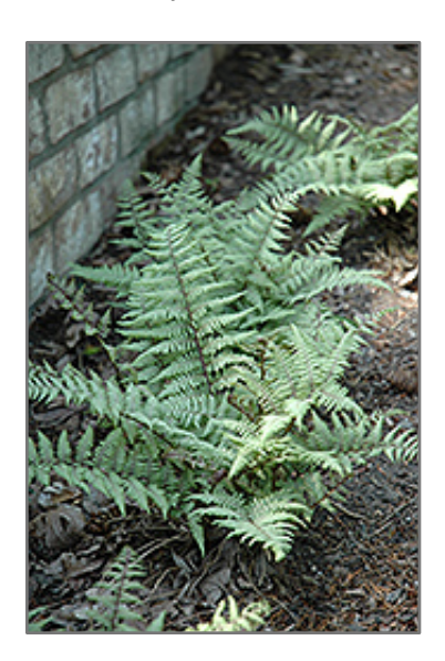
Ghost Fern