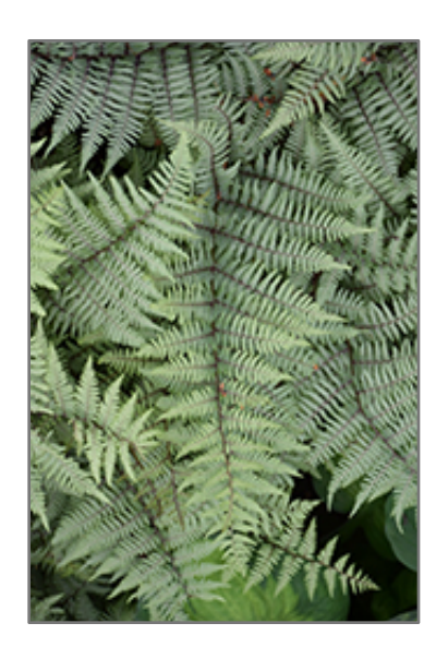
Ghost Fern foliage