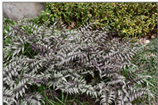
Pewter Lace Painted Fern