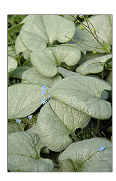
Looking Glass Bugloss foliage

Silver heart shaped foliage create a unique addition to containers, borders and garden landscapes; a shade loving mounded variety that is easy to grow, requiring little to no maintenance; sky blue flowers emerge during the late spring months