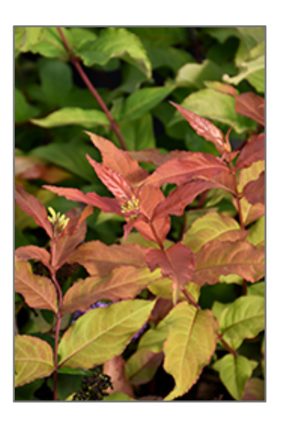
Kodiak Fresh Diervilla foliage

Kodiak Fresh Diervilla is a dense multi-stemmed deciduous shrub with a mounded form. Its average texture blends into the landscape, but can be balanced by one or two finer or coarser trees or shrubs for an effective composition.