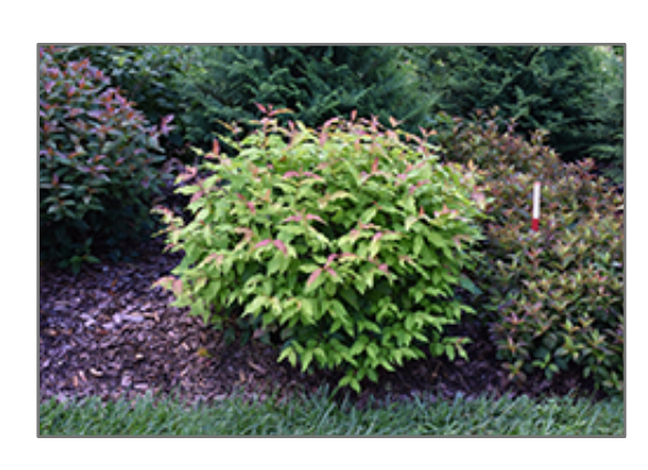
Kodiak Fresh Diervilla

Kodiak Fresh Diervilla makes a fine choice for the outdoor landscape, but it is also well-suited for use in outdoor pots and containers. Because of its height, it is often used as a 'thriller' in the 'spiller-thriller-filler' container combination; plant it near the center of the pot, surrounded by smaller plants and those that spill over the edges. It is even sizeable enough that it can be grown alone in a suitable container. Note that when grown in a container, it may not perform exactly as indicated on the tag - this is to be expected. Also note that when growing plants in outdoor containers and baskets, they may require more frequent waterings than they would in the yard or garden. Be aware that in our climate, most plants cannot be expected to survive the winter if left in containers outdoors, and this plant is no exception. Contact our experts for more information on how to protect it over the winter months.