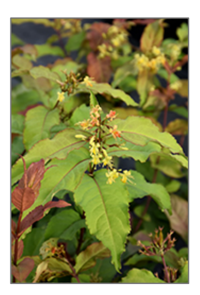
Kodiak Fresh Diervilla flowers