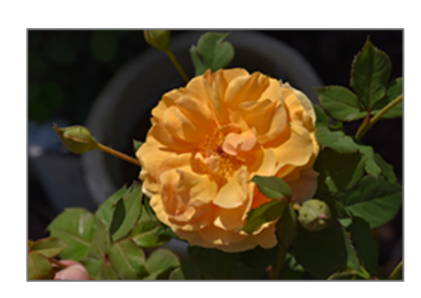
Rise Up Amberness Rose flowers

A wonderful climbing variety with a neat and dense habit that can be pruned into a shrub or allowed to climb trellises and arbors; exceptionally fragrant, ruffled amber colored blooms are accented by glossy, deep green foliage; great cut flower quality