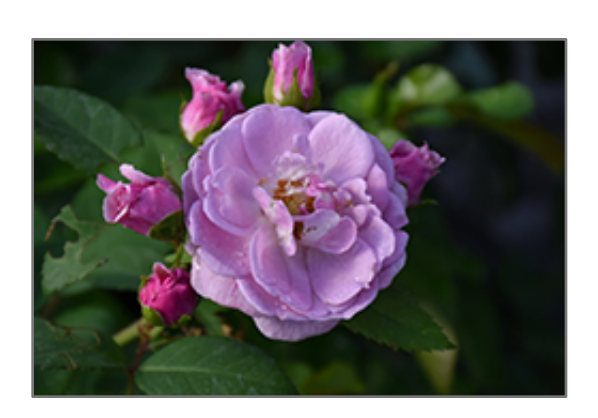
Rise Up Lilac Days Rose flowers