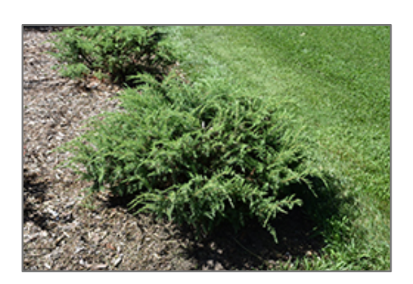
Tortuga Juniper

A low-mounded groundcover evergreen, with pleasing emerald green foliage; exceptionally tough and hardy, and will tolerate the most adverse conditions, particularly dry sites; transforms difficult sites into a carpet of green