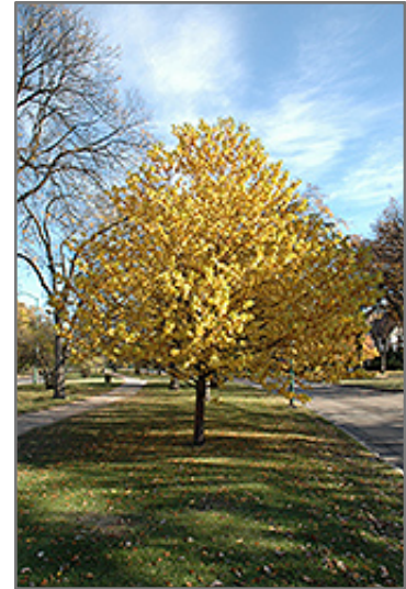
Amur Cherry in fall

This tree should only be grown in full sunlight. It does best in average to evenly moist conditions, but will not tolerate standing water. It is not particular as to soil type or pH. It is somewhat tolerant of urban pollution. This species is not originally from North America.