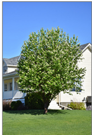
Amur Cherry