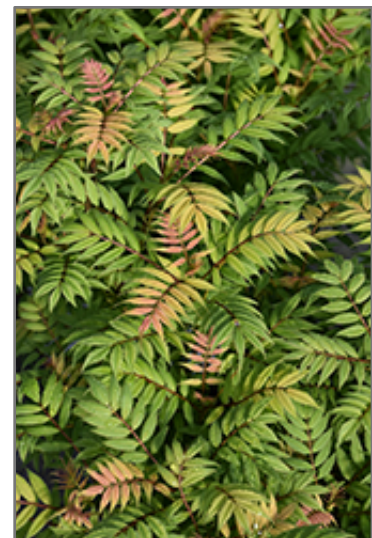
Mr. Mustard False Spirea foliage