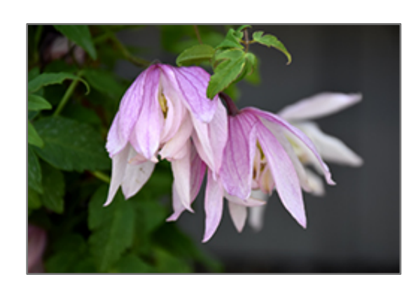
Pink Flamingo Clematis flowers

One of the most dainty and elegant flowering climbers, this variety features an abundance of nodding bell-shaped flowers that range from rich rose red at the base to soft pinks at the edges of the petals, tends to put on a second bloom in fall