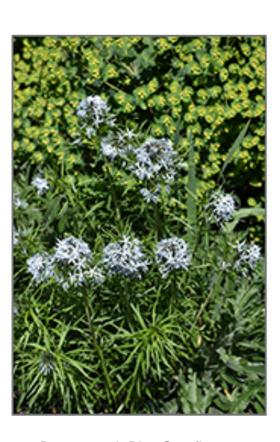
Butterscotch Blue Star flowers

Butterscotch Blue Star has steel blue star-shaped flowers at the ends of the stems from late spring to early summer, which are interesting on close inspection. The flowers are excellent for cutting. Its ferny leaves are green in colour. As an added bonus, the foliage turns gorgeous shades of harvest gold and gold in the fall.