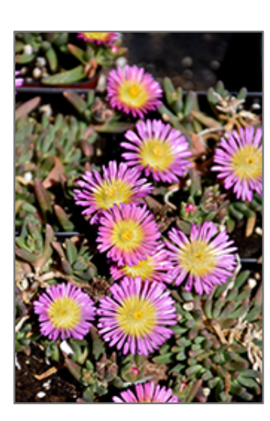
Delmara Pink Halo Ice Plant flowers

A low growing carpet-like, succulent, native to South Africa but amazingly hardy in North America; dazzling pink, daisy-like flowers with bright yellow centers; perfect for xeriscapes, rock gardens, screes and sandy soils