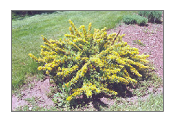
Shrub Broom in bloom

Better known in European gardens than in North America, this compact shrub deserves to be more used here; this rounded shrub has spikes of radiant golden flowers protruding from the branches in late summer when few other shrubs are in bloom