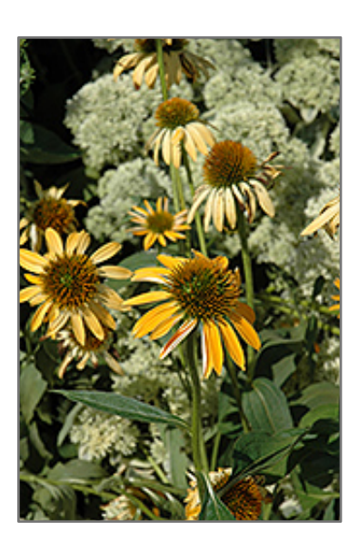
Big Sky Harvest Moon Coneflower flowers

A remarkable variety with eye catching color; strong and bushy habit that is ideal for sunny borders and mixed containers; large and fragrant flowers have striking golden yellow petals surrounding a golden copper cone; deadhead spent blooms