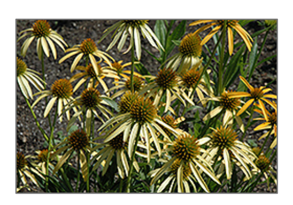
Mango Meadowbrite Coneflower flowers

Heat and disease resistant series, featuring tall, sturdy stems of sweetly fragrant and colorful petals surrounding a deep burgundy-brown cone; easy to grow, excellent for borders, beds, containers and cutting gardens