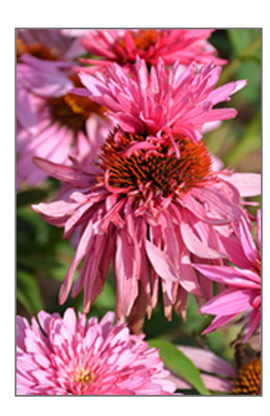
Double Decker Coneflower flowers

Beautiful and unique, this selection features 2 tiers of deep rosy-pink flowers, one recurved along the bottom while the other grows upwards on top of a deep brown cone; excellent for fresh or dried arrangements; heat, drought and humidity tolerant