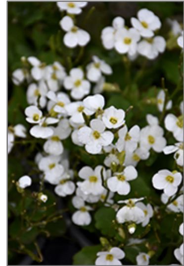
Catwalk White Wall Cress flowers

Catwalk White Wall Cress is recommended for the following landscape applications;