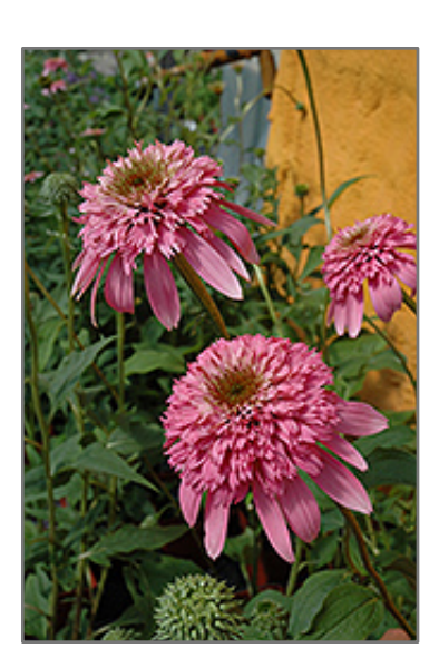
Razzmatazz Coneflower flowers

Stunning double pompom coneflowers are presented on these sturdy, well branched plants; bright magenta-purple petals surround a lovely rosy-pink central pompom, rising above green pointy foliage; excellent in borders, beds and containers; great cut flower