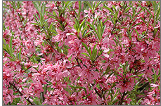
Russian Almond flowers