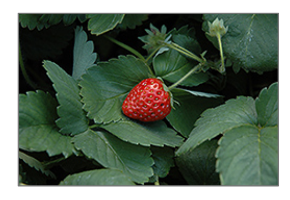
Fort Laramie Strawberry fruit