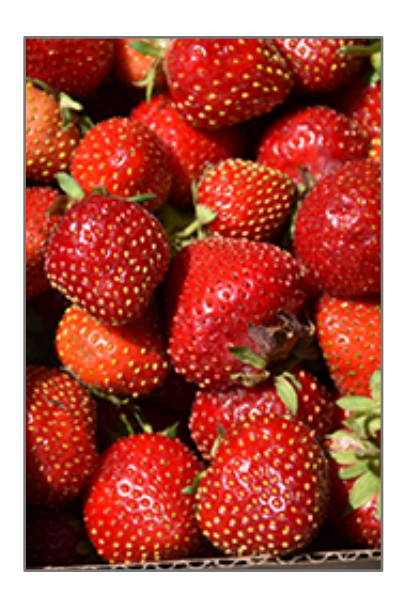
Fort Laramie Strawberry fruit

This is an open herbaceous perennial with a spreading, ground-hugging habit of growth. Its relatively fine texture sets it apart from other garden plants with less refined foliage. This is a high maintenance plant that will require regular care and upkeep, and should not require much pruning, except when necessary, such as to remove dieback. It is a good choice for attracting birds and bees to your yard, but is not particularly attractive to deer who tend to leave it alone in favor of tastier treats. Gardeners should be aware of the following characteristic(s) that may warrant special consideration;