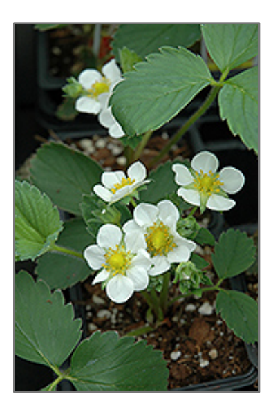
Fort Laramie Strawberry flowers