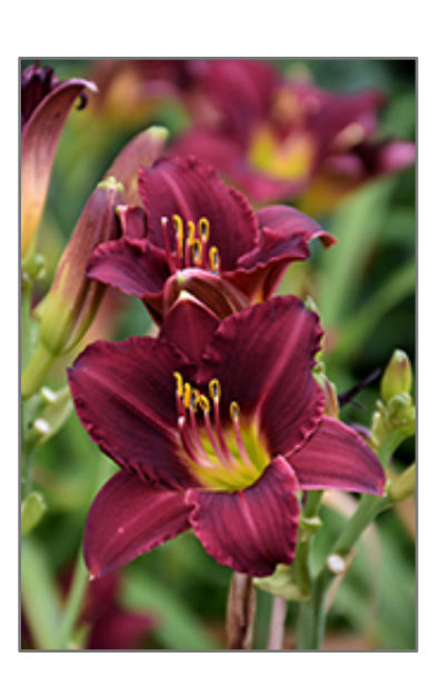
Ruby Stella Daylily flowers