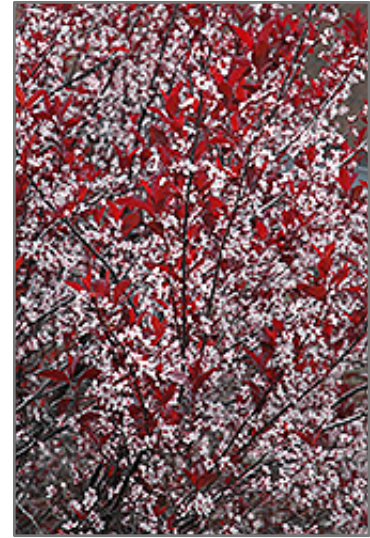
Purpleleaf Sandcherry flowers

This shrub should only be grown in full sunlight. It does best in average to evenly moist conditions, but will not tolerate standing water. It is not particular as to soil type or pH. It is highly tolerant of urban pollution and will even thrive in inner city environments. This particular variety is an interspecific hybrid.