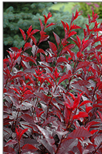
Purpleleaf Sandcherry foliage

This is a relatively low maintenance shrub, and is best pruned in late winter once the threat of extreme cold has passed. It has no significant negative characteristics.