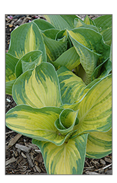
Great Expectations Hosta foliage

A beautiful variety featuring neat mounds of large, blue-green foliage with chartreuse centers and margins; pale lavender flowers appear on tall scapes during the summer months; adds texture, color and contrast to shaded beds, borders and containers