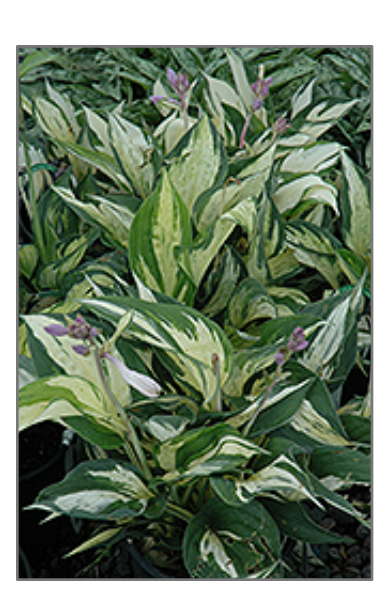
Revolution Hosta in bloom

A medium sized variety perfect for front of borders and bed; interesting foliage with cream centers, speckled with light green and edged in deep green; low maintenance and easy to grow; great for adding color and texture