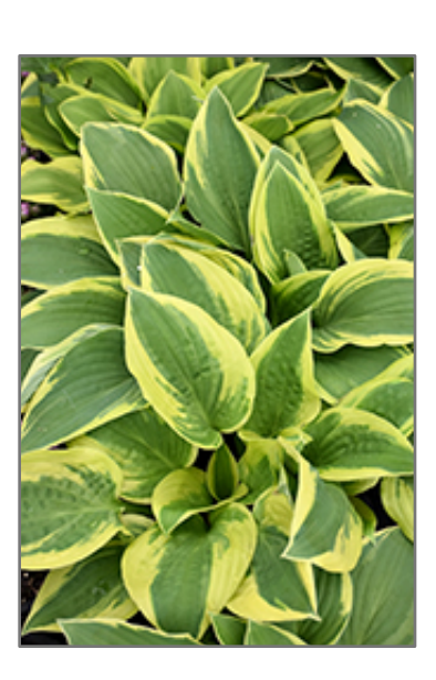
Wide Brim Hosta foliage

Shade loving with a lovely mounded habit, perfect for beds, borders or containers; features dark green leaves with irregular buttery yellow margins; pale lavender flowers appear on tall scapes during the mid to late summer months; easy to grow