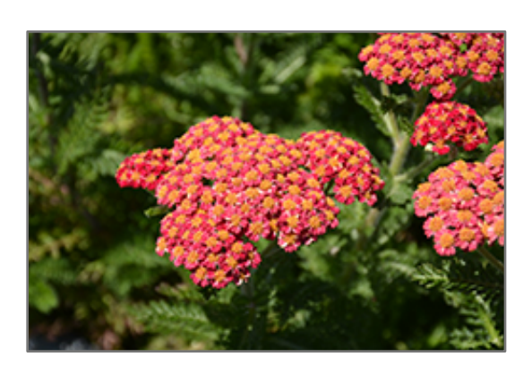
Skysail Fire Yarrow flowers

Large umbels of vibrant, scarlet red blooms that slowly fade to shades of orangey pink to cream, with all shades showing at once; excellent for xeriscaping and hot, sunny, dry locations; perfect for beds, border fronts, and containers