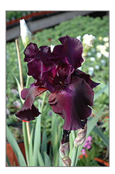
Superstition Iris flowers