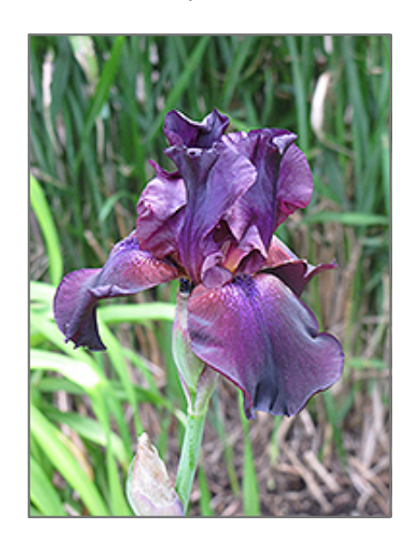
Superstition Iris flowers