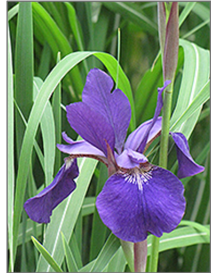
Caesar's Brother Siberian Iris flowers