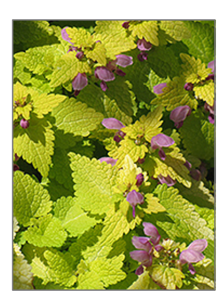
Golden Spotted Dead Nettle flowers

Golden Spotted Dead Nettle has masses of beautiful spikes of violet flowers rising above the foliage from mid spring to early fall, which are most effective when planted in groupings. Its attractive oval leaves emerge yellow in spring, turning lemon yellow in colour with prominent silver stripes throughout the season.