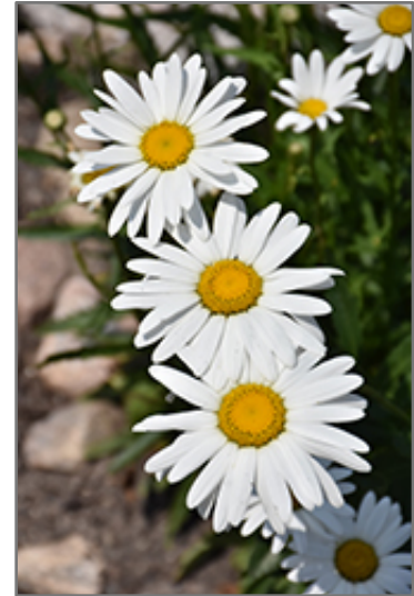
Silver Princess Shasta Daisy flowers