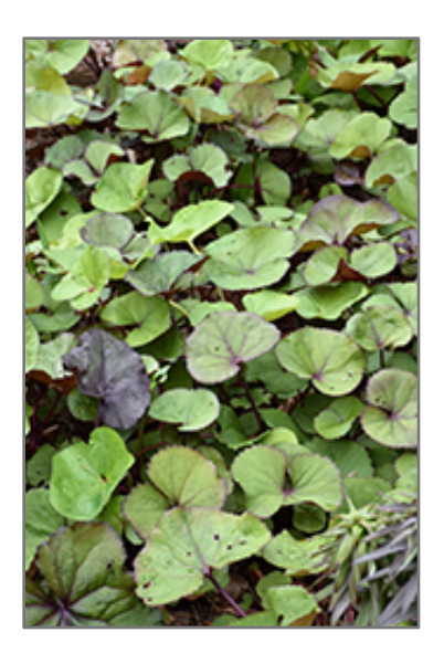
Othello Rayflower