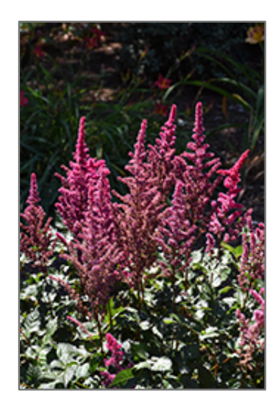
Visions Volcano Astilbe in bloom