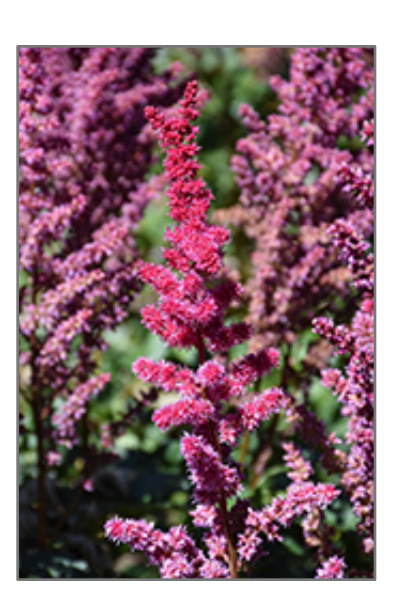
Visions Volcano Astilbe flowers