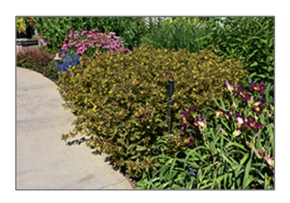
Purpleleaf Loosestrife in bloom

This is a high maintenance plant that will require regular care and upkeep, and is best cleaned up in early spring before it resumes active growth for the season. It is a good choice for attracting butterflies to your yard. Gardeners should be aware of the following characteristic(s) that may warrant special consideration;