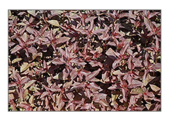
Purpleleaf Loosestrife foliage

Purpleleaf Loosestrife is a dense herbaceous perennial with an upright spreading habit of growth. Its relatively fine texture sets it apart from other garden plants with less refined foliage.