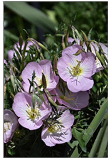
Evening Primrose flowers