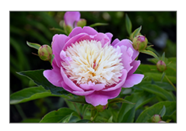
Bowl Of Beauty Peony flowers

Bowl Of Beauty Peony features bold lightly-scented rose cup-shaped flowers with buttery yellow eyes and creamy white anthers at the ends of the stems from late spring to early summer. The flowers are excellent for cutting. Its compound leaves remain green in colour throughout the season.