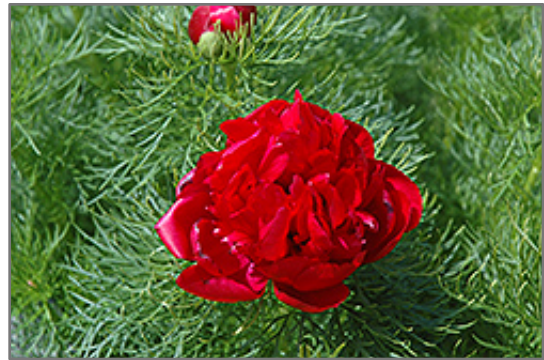
Double Fernleaf Peony flowers