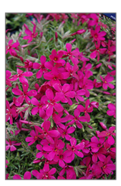
Crackerjack Moss Phlox flowers

Crackerjack Moss Phlox is covered in stunning lightly-scented fuchsia star-shaped flowers at the ends of the stems from early spring to early summer. Its tiny needle-like leaves remain green in colour throughout the year.