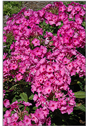
Flame Pink Garden Phlox flowers